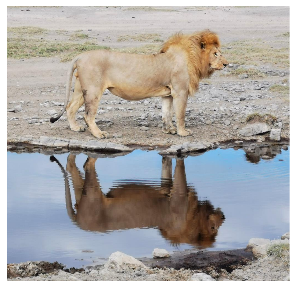
DAY 6, 7, & 8: SERENGETI

INCLUDED: Morning and Afternoon game drives in Ngorongoro Crater and/or Serengeti, NP fees